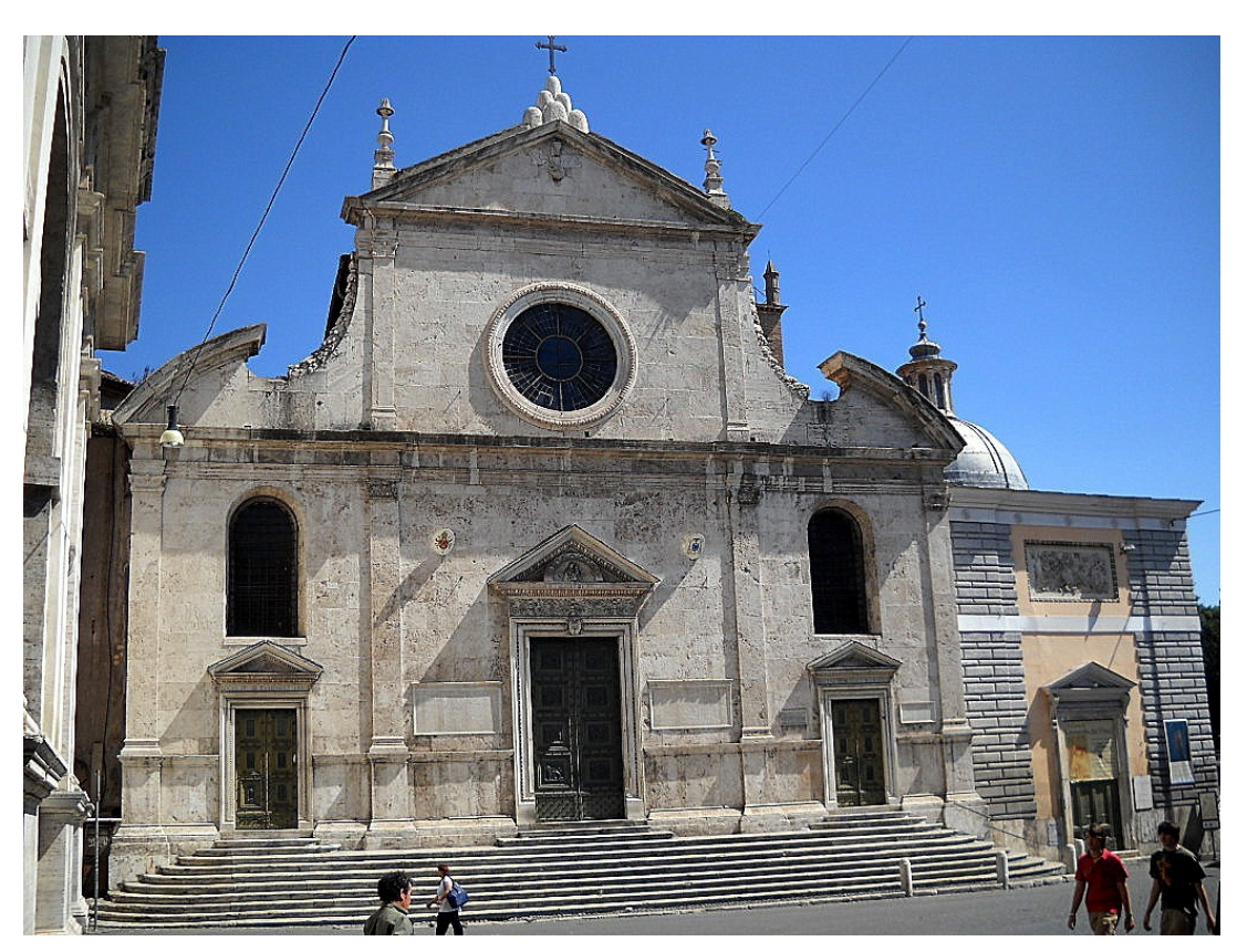
The facade of Santa Maria del Popolo

Santa Maria del Popolo is a notable Augustinian church located in Rome. It stands to the north side of the Piazza del Popolo, one of the most famous squares of the city, between the ancient Porta Flaminia (one of the gates of the Aurelian Walls and the starting point of the Via Flaminia, the road to Ariminum (modern Rimini) and the most important route to the north of Ancient Rome) and the Pincio park. (1)