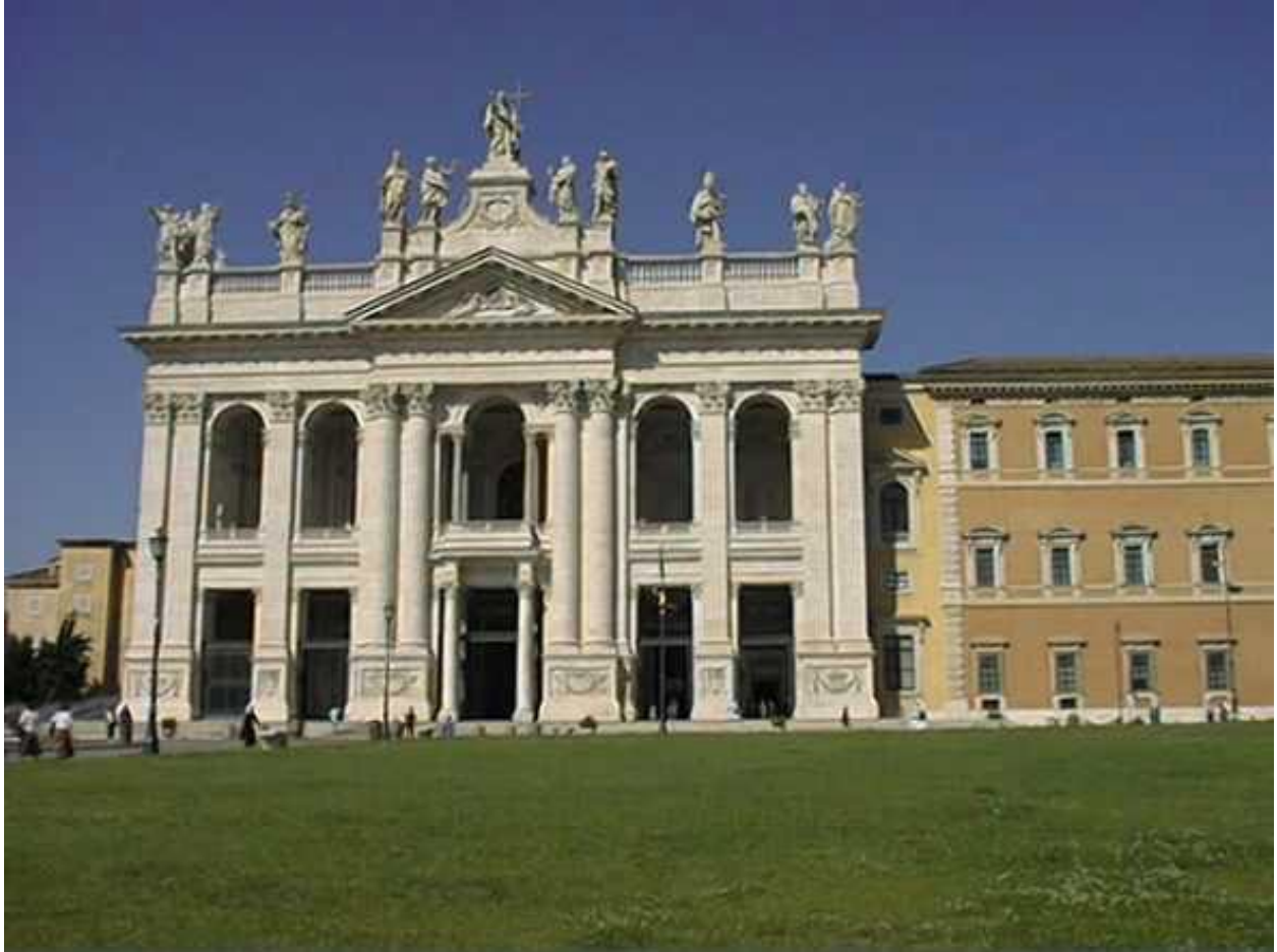
Piazza di San Giovanni Laterano